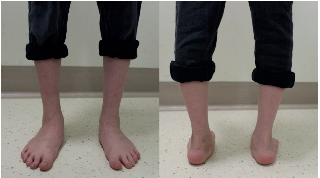
7 year old child with flattened foot arches and rolling in at the ankles

Wearing suitable shoes is strongly recommended to give adequate support, prevent injury and provide comfort in children with OI.