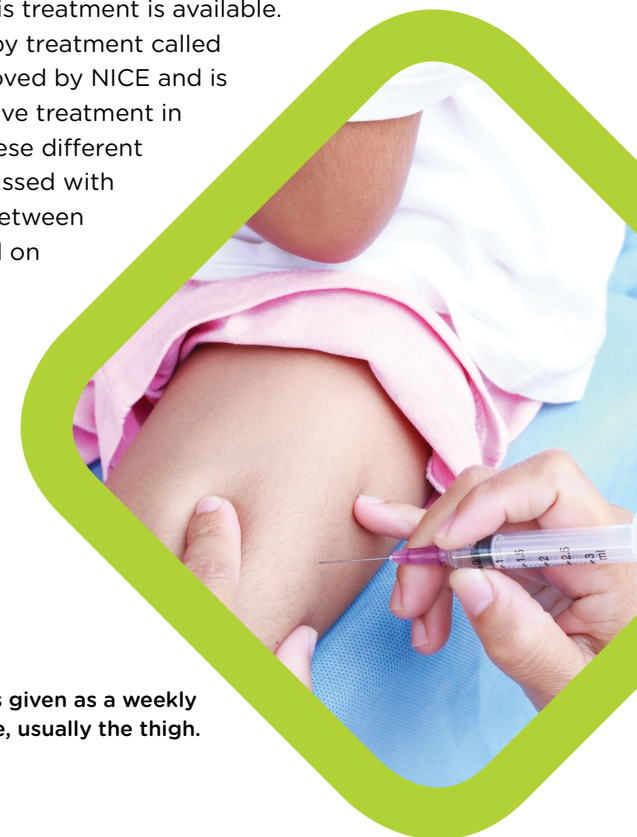
PEG-ADA treatment is given as a weekly injection into a muscle, usually the thigh.

A related, commercial gene therapy treatment called Strimvelis has been recently approved by NICE and is available to families as an alternative treatment in Milan. The differences between these different gene therapy options will be discussed with the families in detail. The choice between HSCT or gene therapy will depend on whether there are well-matched donors available for transplant and will be discussed at length between the parents and the transplant and gene therapy teams.