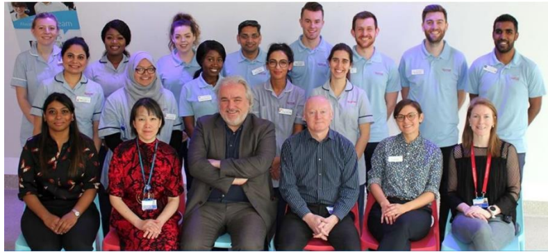
The sleep study team

A sleep study is a test to see what happens to your body when it is asleep. When we're asleep, we aren't usually aware of what is happening with our basic functions. For example our breathing can become laboured, we can snore or make funny movements. You might not even think to talk to your doctor about these issues although your child may be tired during the day as a consequence. The doctor might suggest that your child has a sleep study if they suspect they have a sleep-related disorder, like sleep apnoea or hypoventilation.