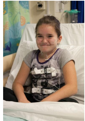
Ready for bed

Once these sensors have been attached, your child will be able to sleep normally.