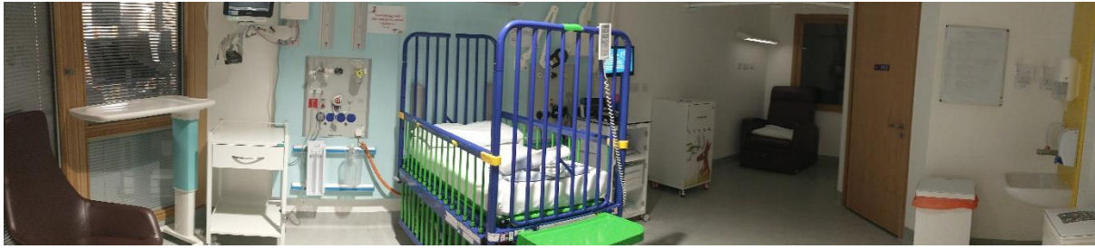
The Sleep Bedroom on Kangaroo