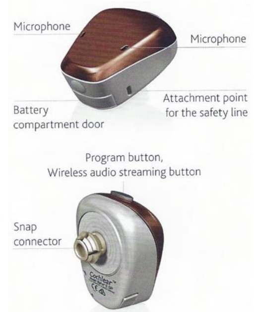
Figure 2: Cochlear Bone Anchored hearing device

If your child Bone anchored hearing aid stops working, follow the instructions below: