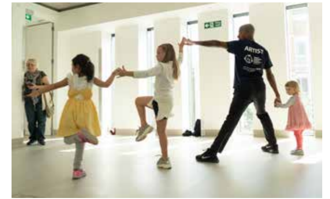
Left: Dance performance by Wayne McGregor Studio Right: Together Chorus