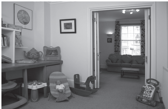
Play room and lounge