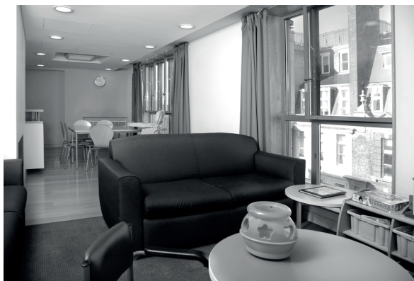
Communal area and kitchen

There is a refundable deposit of £10, which is payable when you check in and an additional £10 deposit is required if you need a remote control for the television in the room. If you leave the room in the condition you found it and return the remote control, these deposits will be given back to you. There are no other charges for you to stay.