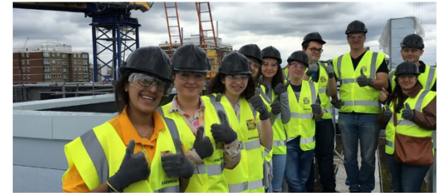
YPF tour the Premier Inn Clinical Building

In June, the YPF website has had 102 unique page views and the Blog had 51. Statistics show that people are coming to the site and reading the information - the average time was four minutes and 19 seconds!