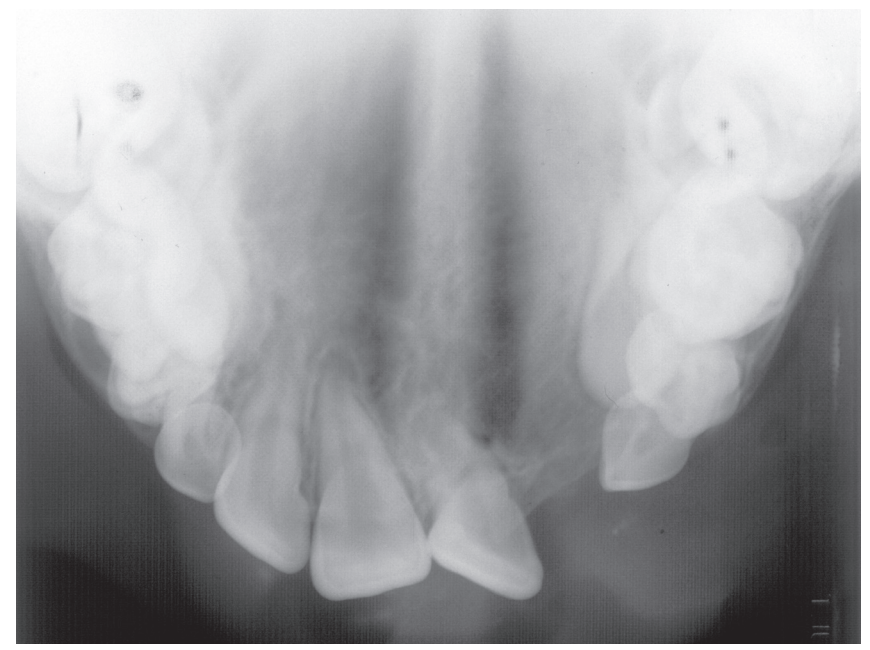
X-ray of the filled cleft (arrow)

Other children may need some baby teeth that are in the way of the operation removed beforehand, so that the gum is fully healed by the time of the operation. If your child has a bilateral cleft then the operation may need to be done on both sides and often this will require two procedures undertaken three to six months apart.