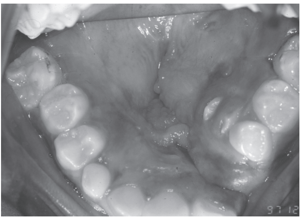
Photograph of an alveolar cleft

An alveolar bone graft fills the cleft of the alveolus with bone, aiming to help the teeth to erupt. However, teeth do not always erupt into the right position. Your child may need a brace at a later stage to move the teeth into a better position and to the straighten the teeth.