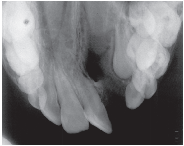
X-ray of alveolar cleft

If there are other abnormalities of the teeth, your child may also need other dental work. For example, missing teeth may be replaced, unsually shaped teeth may be reshaped and extra teeth may be removed. There can sometimes be impacted teeth, which need to uncovered from underneath the gum.