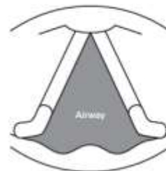
Resting vocal cords (when we breathe in and out without voice)

When young children talk, their vocal cords vibrate together about 300 times a second. This vibration occurs using air from the lungs and small muscle adjustments in the voice box. If the vibration is forced or strained then the vocal cords can become sore and red.